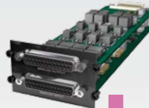
AN8.IO 8 ch line input / output