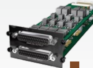
MIC8.LINE.IO 8 ch mic input / line output