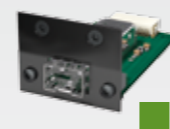
SFP.IO MADI SFP cage