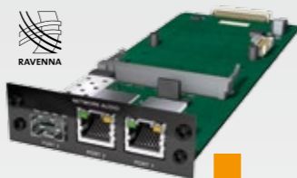
RAV.IO RAVENNA / AES67