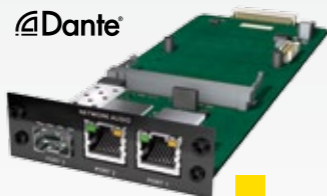
DANTE.IO Dante Brooklyn