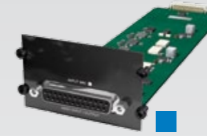
AES4.SRC.IO 4 port AES3 input with SRC / output