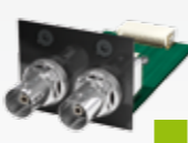
BNC.IO MADI coaxial BNC, 75 Ω