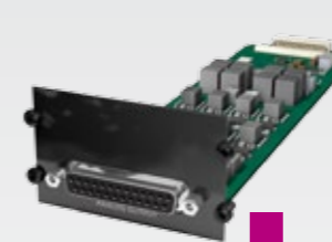
AN8.O 8 ch line output