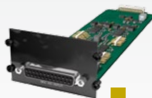
MIC8.HD.I 8 ch mic high density input