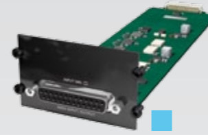
AES4.IO 4 port AES3 input / output