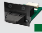
SC.IO MADI SC-socket